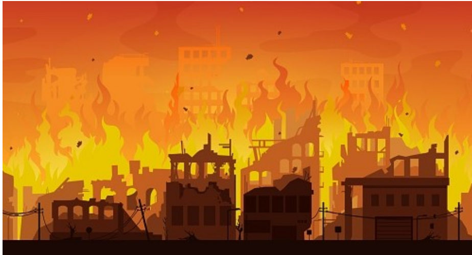
The capital city of Fuocus on fire.

You live in the country of Fuocus, and you recently watched a documentary about the devastating effects of fires. So now you are wondering what will happen if a fire starts in your country.